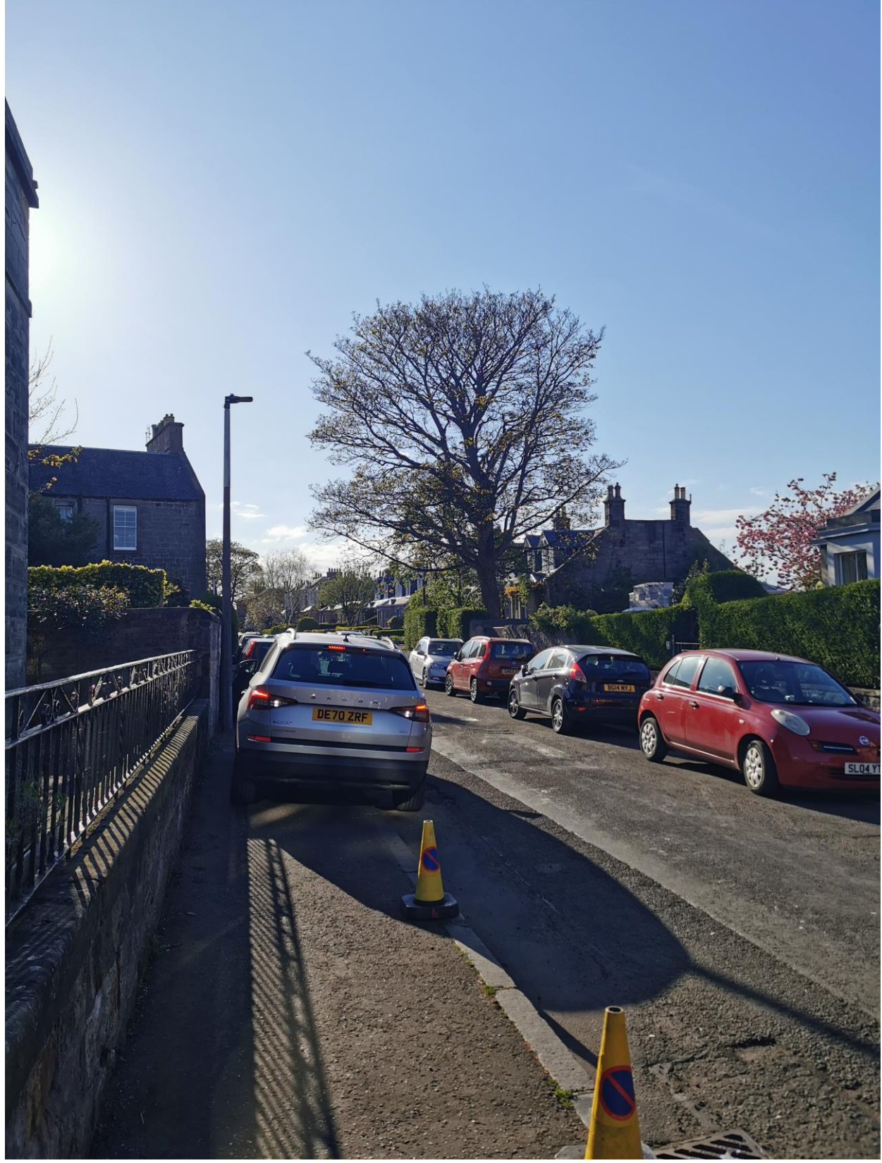
Fig. 2: The tree as viewed from the east